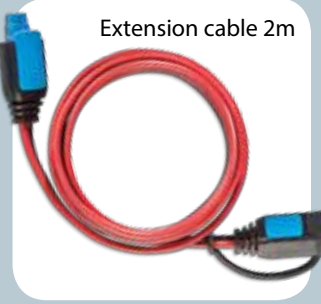
Extension cable 2m