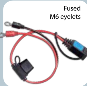
Fused M6 eyelets